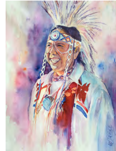
Piute Youth by Wanda Drake