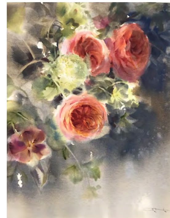
Noctume by Tatsiana Harbacheuskaya BEST OF SHOW

presents the 2020 Fall Show September 10 to November 21, 2020 at the Sahara West Library 9060 W Sahara Ave • Las Vegas, NV