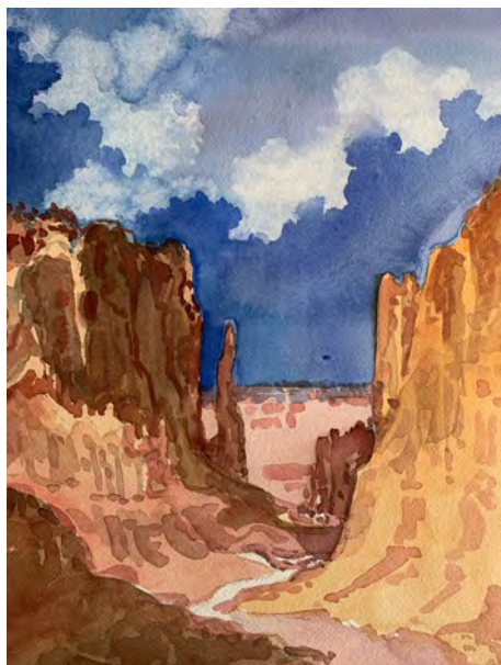
Majestic Canyon by Barrie Cooke Folsom SECOND PLACE