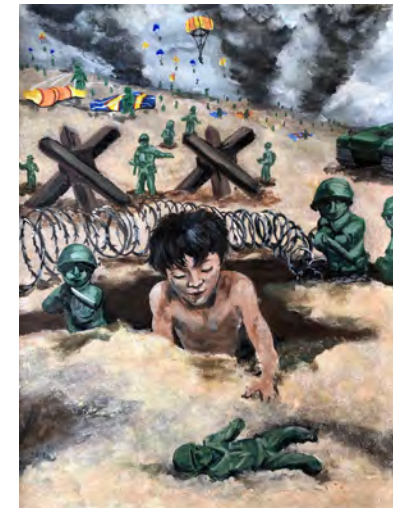
Desensitized by Roy Park