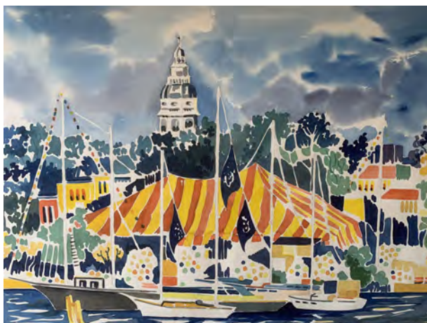
Boat Show Excitement by Barrie Cooke Folsom SECOND PLACE