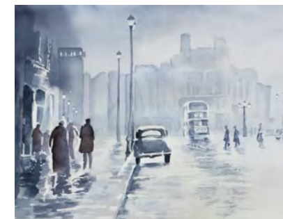
Foggy Day in England by Myra Oberman