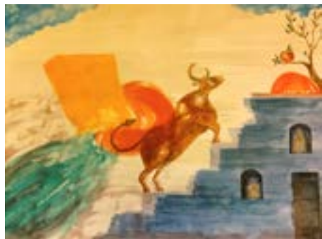
Illusion of an Ox with Arrow Tail (22x30)