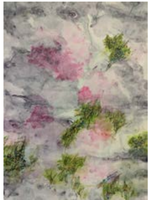
Lasting Peace (18x24)