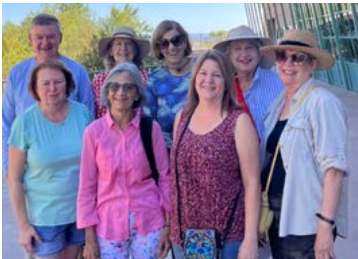
Participants of the October 7 paint out at the Wetlands.

Friends of the Wetlands hosted reception is Sun, 11/12, 1–3pm.