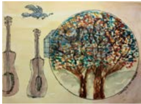
House I Live In (8x11.5)