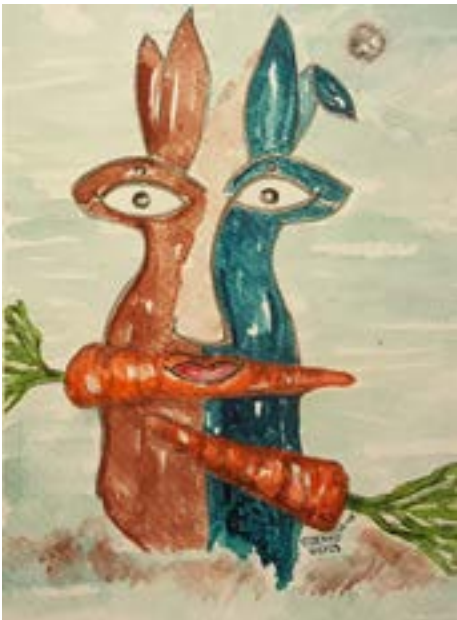
Rabbit's Good Habits (8x10)