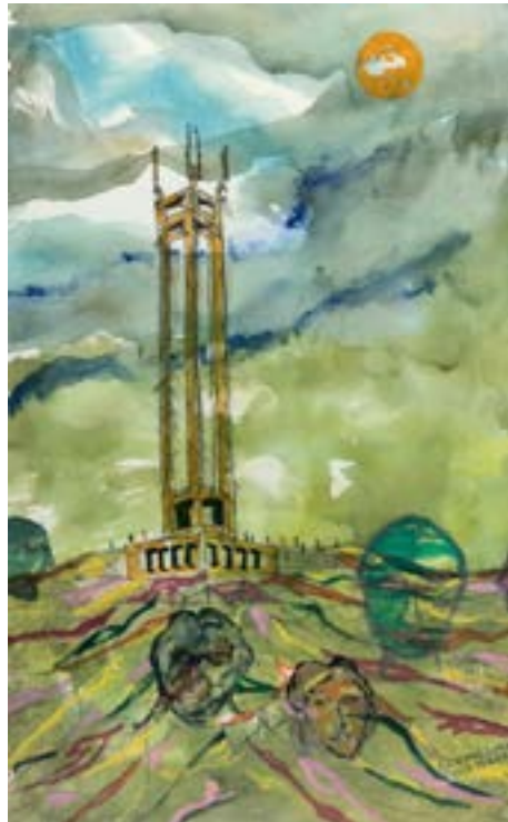
Tower of Racial Diversity and Equality (12x18)