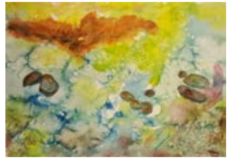
La Solfatara (22x30)