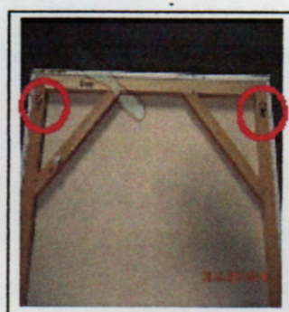
Photo (above left) is of the hook and cable system we use in all our galleries

The d-rings should be installed 2 inches down from top of art as shown above (if art is 10" or smaller please contact me for further instructions)