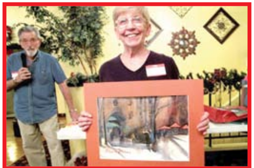
A great time at December's holiday party and monthly meeting