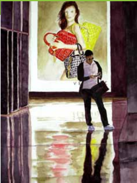
Best of Show "Text and Shop" by Myra Oberman