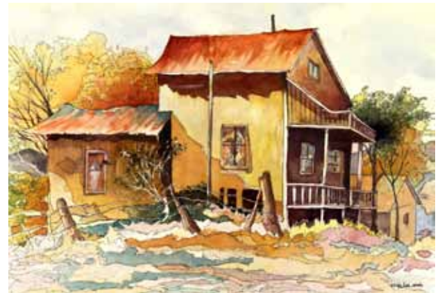
Second Place "This Ol' House" by Ed Klein