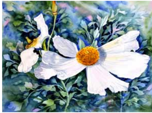
First Place "Matilija Poppy" by Sue Roach