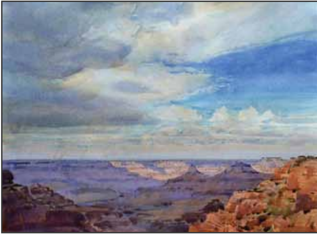
Canyons in the Sky, watercolor 22x30"