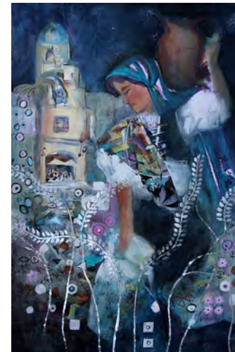
"Pray for Syria" by Elena Wherry