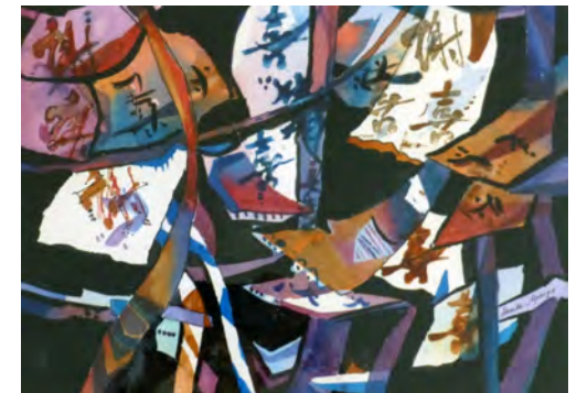
Prayer Flags by Sheila Spargo