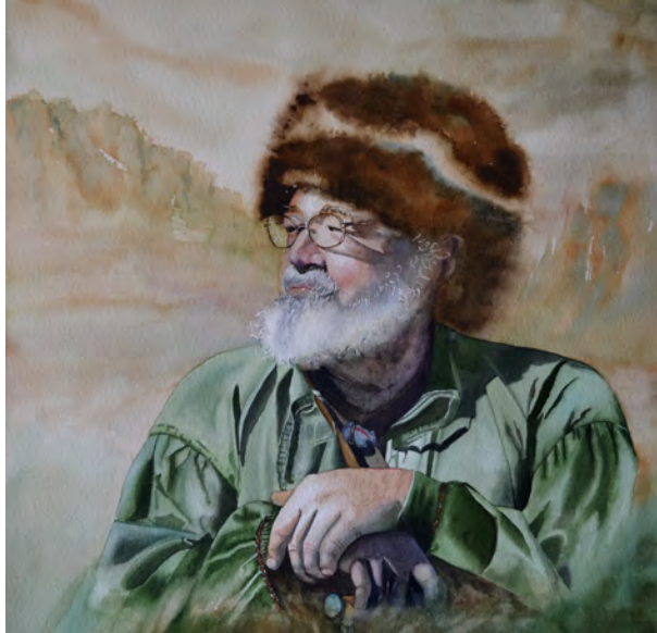
The Trapper by Sue Roach